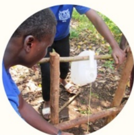
Building a hand-washing station for a local family

To download "Active Learning Ideas for Teachers Booklet"